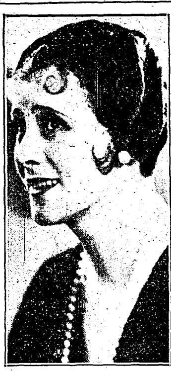
Irene Rich, charming screen actress, will be the guest star of The Tribune School of Cookery at the Aragon ballroom Tuesday afternoon, 1:45 to 4:45 p.m.