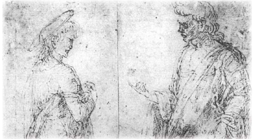
"Two Apostles" Francesco di Giorgio Martini, 1490